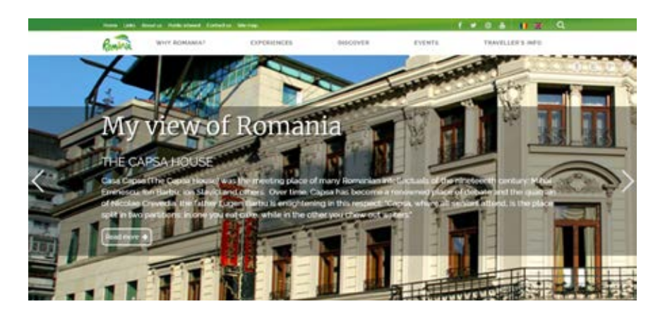
Figure 2. Romania Travel homepage (http://www.romania.travel/, accessed on June 10, 2018)

The Romania Travel homepage (http://www.romania.travel/, accessed on June 10, 2018) offers an interactive experience (Figure 3), with a horizontal user journey and a "carousel" presenting key touristic objectives and cultural symbols (Capşa House, the meeting place of many Romanian intellectuals of the nineteenth century, Sibiu, the European Capital of Culture in 2007, Braşov's coat of arms, citadels, the Merry Cemetery, and Christmas traditions). The modality is medium and one can notice authentic photographs of touristic objectives. The text is personal ("My view of Romania"), inviting the tourists to create their own travel experiences.