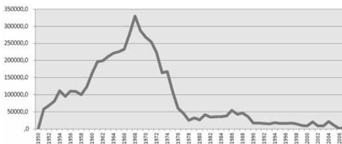
Figure 1. Volume of production, codfish, Spain (Tn). 1950–2006 Source: Own elaboration based on FAOSTAT. Global Production Statistics 1950-2007.